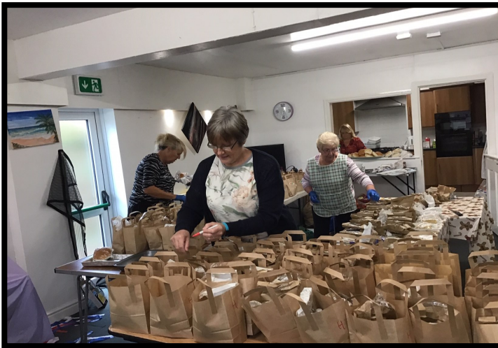
Food parcels being prepared

This half term G-Force and Altrincham Hale Muslim Association are working together to provide 300+ FREE healthy lunches to children living in Altrincham.